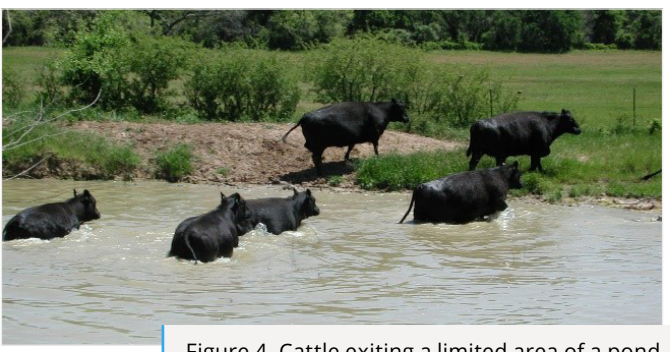
Figure 4. Cattle exiting a limited area of a pond.

To prevent future erosion of pond edges, cattle access can be limited to one area of the pond by using fencing or other barriers (Fig. 4). Limiting access to a single or a few watering points for livestock—and by placing large cobblestones in these access points—may decrease wading time and erosion and reduce the suspension of clay particles and nutrient concentrations. The overall water quality will also improve.