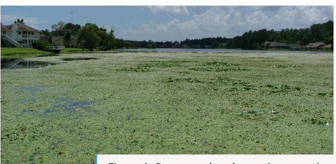
Figure 1. Over-populated aquatic vegetation.

Many species of aquatic vegetation can over-populate very quickly after entering a fertile body of water (Fig. 1). Ponds are nutrient sinks—a place where incoming nutrients from the watershed accumulate over time. This makes ponds the perfect place for aquatic vegetation to grow, often negatively impacting evaporation rates, recreation, aesthetic value, fish, and wildlife habitat. An aquatic vegetation issue is further amplified because most ponds in Texas are used as livestock watering "tanks," which continuously accumulate nutrients from livestock waste.