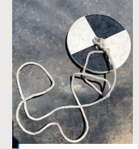
Figure 7. Standard Secchi disk design.

the bottom of a 5-gallon bucket. Drill a hole directly in the center of the disk-shaped item and then paint the entire surface white. Black paint may be added to match the disk pictured in Figure 7, but it is not needed. To add weight, attach a close-fitting bolt through the hole and secure it with a washer and nut. At the head of the bolt, attach a string to complete the disk.