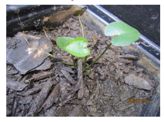
Figure 8. Crested floating heart growing in moist soil in a greenhouse.

of rivers with low current flow. It is also capable of growing and producing leaves in moist, non-submersed soils (Figure 8).