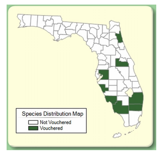
Figure 6. Distribution of crested floating heart in Florida (Wunderland 2011).