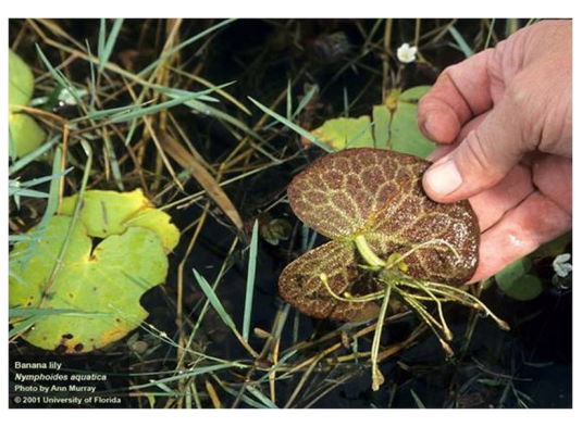
Figure 4. N. aquatica, banana lily