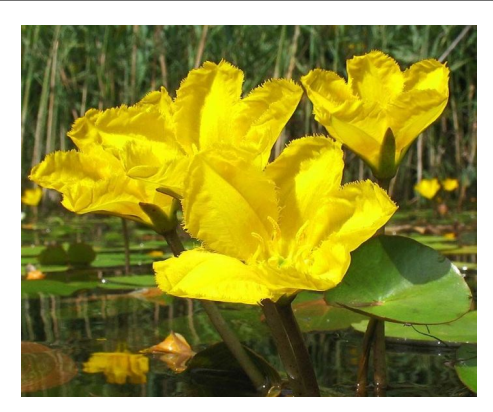
Figure 1. N. peltata, yellow floating heart