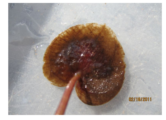
Figure 5. N. cordata, little floating heart