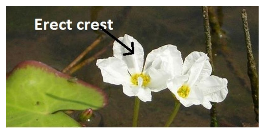
Figure 3. N. cristata, crested floating heart