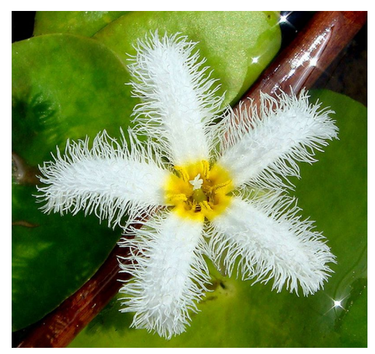
Figure 2. N. indica, water snowflake