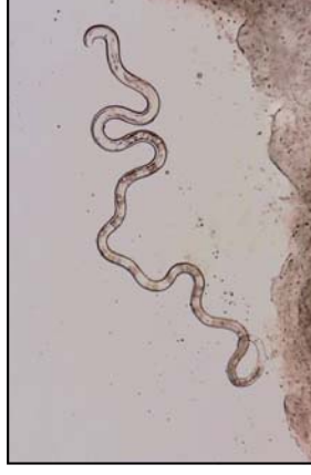
Adult Capillaria with eggs inside