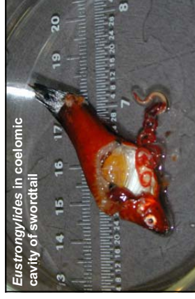
Eustrongylides in coelomic cavity of swordtail