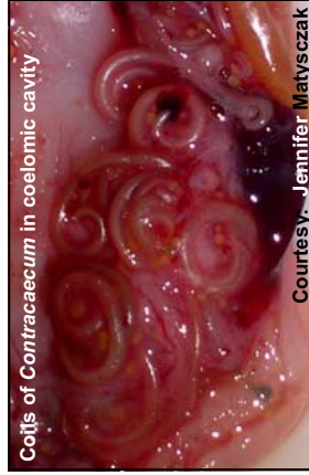
Coils of Contracaecum in coelomic cavity