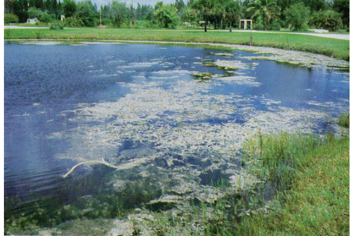
Figure 3. A heavy infestation of Hydrilla in a Southeast Florida pond.

Removal of hydrilla with 40 fish per acre (100 per ha) is shown in Figure 3 and Figure 4. A dense growth of any weed will obviously require more fish than a sparse amount of the plant. One approach is to stock 20 to 30 fish per acre (50 to 75 grass carp per hectare). Then in a year to a year and a half, add more fish if the desired level of control has not been achieved.