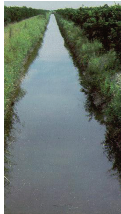
Figure 6. Southwest Florida citrus irrigation and drainage ditch with Hydrilla controlled by grass carp following herbicide application. Twenty fish per acre can manage Hydrilla and shoreline grasses under these conditions and give economical long-term control. Credits: David L. Sutton

Limited work has been done on the use of grass carp in conjunction with mechanical control methods prior to fish stocking. However, it is likely that the number of fish required following mechanical removal of hydrilla would be higher than the number required after application