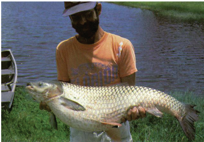
Figure 2. A mature grass carp, highly effective in controlling Hydrilla and many other noxious aquatic weeds.

The most promising biological agent for many submersed plant problems and some other aquatic weeds is the grass carp (Figure 2), also sometimes called the white amur.