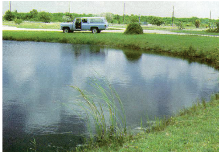
Figure 4. Pond (Shown in Figure 3) with Hydrilla controlled after one year following a stocking with forty grass carp per acre.

In a body of water, the area infested with weeds in relation to the total area may be taken into consideration when determining the number of fish to stock. Transect lines, a recording fathometer, biomass sampler, or aerial surveys can be used to help estimate the amount of weeds present. In this way, the fish can be stocked according to the amount of vegetation, rather than the total area of the body of water under consideration.