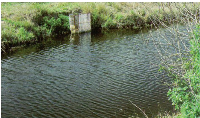
Figure 7. Fish barrier installed on a water control structure in a citrus irrigation and drainage canal. Fish barriers are used to manage unwanted grass carp movement in the agricultural waterways.

In bodies of water with culverts or canals leading to other areas, screens or gates must be installed to prevent escape of the grass carp. Barriers need to be constructed so the fish cannot jump over them. Screens (Figure 7) have proven effective in preventing movement of grass carp while allowing unrestricted movement of water. This type of barrier must have spaces between the bars narrower than the stocked grass carp's body width.