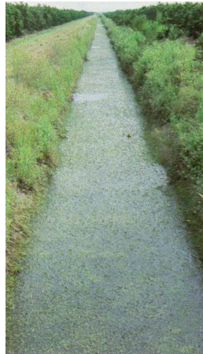
Figure 5. Southwest Florida citrus irrigation and drainage ditch with dense Hydrilla which blocks water movement.

The grass carp has also provided control of hydrilla in some flowing water situations. Figure 5 and Figure 6 show an agricultural canal before and after use of herbicides and stocking of grass carp.