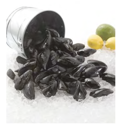
Figure 1. Delicious and nutritious blue mussels, Mytilus edulis .

Essential Fatty Acids (EFAs) that are known to be healthy. For instance mussels have a relatively high ratio of omega-3 to omega-6 EFAs, which has been shown to be associated with lower incidence of cardio-vascular diseases. They are also a very rich source of vitamin B-12, with a 3.5 oz. serving providing 200% of the recommended daily requirement for an average adult. However, mussels are also relatively high in cholesterol with a single portion providing nearly 10% of the adult daily requirement.