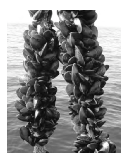
Figure 2. Blue mussels attached in clumps to an aquaculture line.

An adult mussel may reach a maximum shell length of about 15 centimeters (about 6 inches) in undisturbed populations. They more typically reach shell lengths of about 10 centimeters (4 inches) in most areas as they grow while attached to surfaces in gregarious clumps (Figure 1) (Dolmer, 1998). Mussels attach themselves to hard surfaces or other mussels via a series of thin threads known as byssal threads (Figure 2). These byssal threads are synthesized by a byssal gland that is associated with the foot of the mussel, and they can be no longer than the length that the mussel's foot can extend outside the shell. The entire clump of byssal threads is known collectively as the byssus (Figure 3).