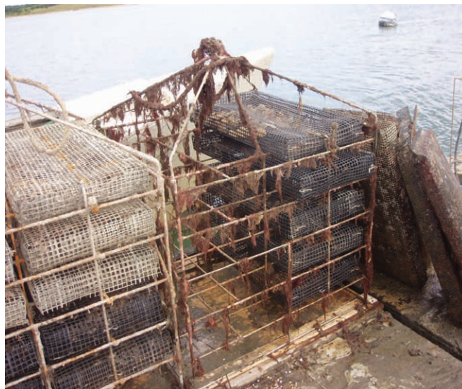
Figure 11. ADPI bag holding scallops for growout.

As noted for suspended nets, stocking density of cages, bags, floating trays or any flat-bottom grow-out system without internal structures should be gauged by the available surface area. A good rule of thumb is not to