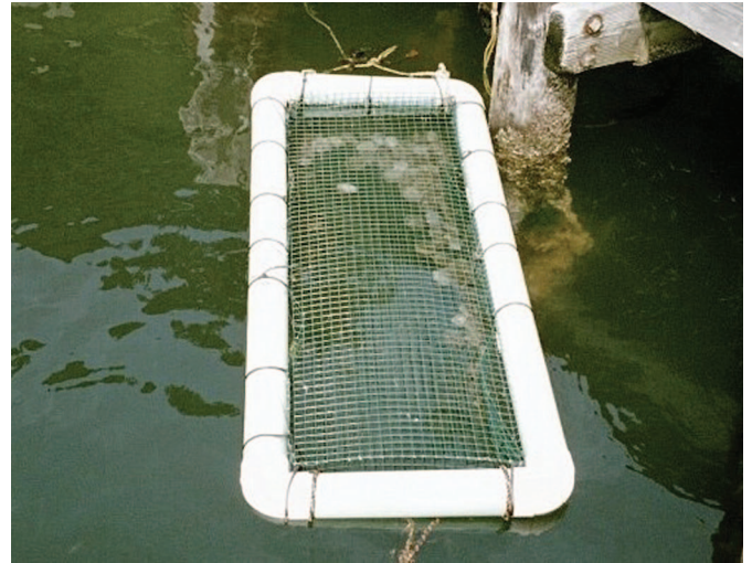
Figure 8. Scallop floating cage reminiscent of Taylor floats.

The original floating scallop cage was constructed as a wooden frame with plastic mesh covering the sides. The development of plastic coated wire led to the creation of a floating scallop cage that is reminiscent of the Taylor Float, commonly used for oyster gardening (Figure 8).