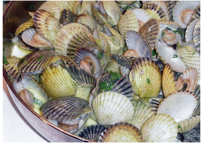
Figure 17. A new product emerges: bay scallops cooked whole "in the shell."

While the interest for commercial bay scallop aquaculture has grown in the U.S., a new way of marketing bay scallops has emerged. The new "in-the-shell" product, a smaller bay scallop (45-55mm) sold and eaten as a whole live animal, could allow growers to harvest at the end of the first growing season therefore avoiding the risk of over-wintering losses (Figure 17).