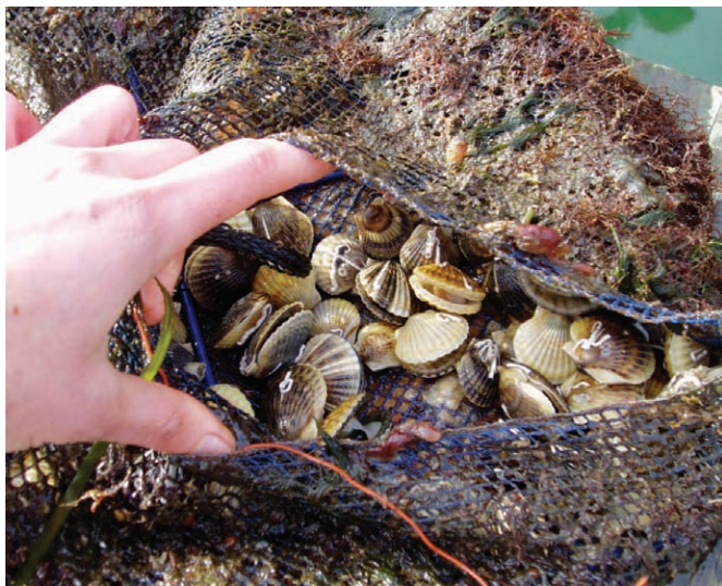
Figure 3. Biofouled gear will limit food flow.

Scallops will feed at an optimum rate in a flow of 1 to 5cm/s. Keep in mind that any structure surrounding the scallop will interfere with the flow. Depending on the containment device, higher overall current speeds may be necessary to achieve optimal food flux within the device. As submerged gear becomes fouled, the food flux is reduced leading to suboptimal growth. Unfortunately for the scallop farmer, the more productive the water, the more abundant will the fouling organisms be (Figure 3). What advantages are gained in increased