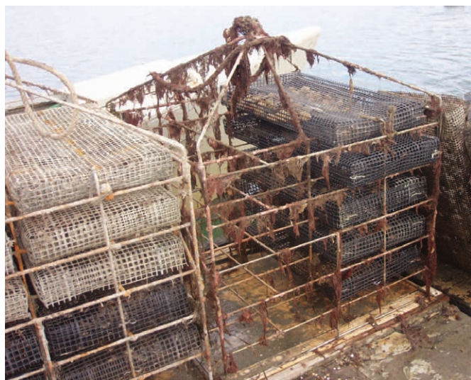
Figure 10. Stainless steel bottom cage.

Bottom cages are generally constructed from plastic coated wire and provide a rigid frame with a series of shelves holding semi-rigid polyethylene bags (Figure 10). Bottom cages allow the grower to construct a single structure with a fixed mesh size, generally 1 to 3” square mesh – with less surface available for biofouling, while still having the capacity to change the mesh size of the containment as the scallops grow.