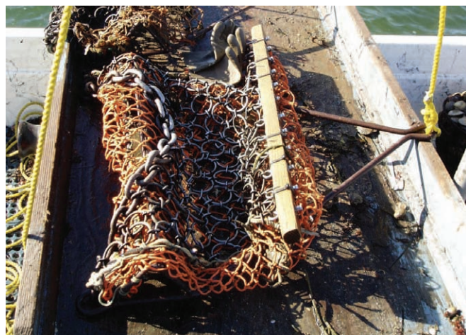
Figure 15. Scallop dredge on culling board.

Generally composed of a cutter bar in the front that sweeps the scallops up and into a trailing bag, dredges are frequently fished in multiples of two to balance the load on the boat and to maximize catch per trawl (Figure 15). Powered dredging may have a negative impact on seagrass beds and result in loss of scallop habitat. To minimize this impact, harvesting efforts should rotate between mechanized and non-mechanized techniques annually or bi-annually within a specific area.