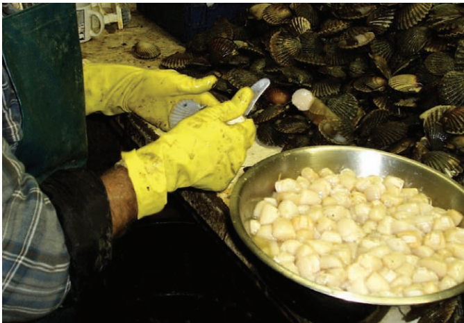
Figure 16. Scallop shucker flinging the adductor muscle into a bowl.

In the U.S., only the single adductor muscle of the scallop or "eye" is traditionally marketed. This product requires a special knife and a three-step hand processing method called "shucking" where in three single movements, the valves are separated, the viscera removed and the single muscle detached from the shell into a container (Figure 16).