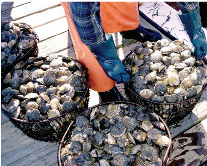
Figure 1. The highly-priced bay scallop, Argopecten irradians .

The rapid growth rate, high market value, and declining wild stocks of the bay scallop Argopecten irradians easily explain private growers' rising interest to culture the species to market size (Figure 1).