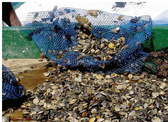
Figure 4. Scallop seed ready for planting.

The unprotected release of juvenile scallops onto the bottom is a common strategy for rearing scallops and is primarily used for restoration and enhancement programs (Figure 4 and 5).