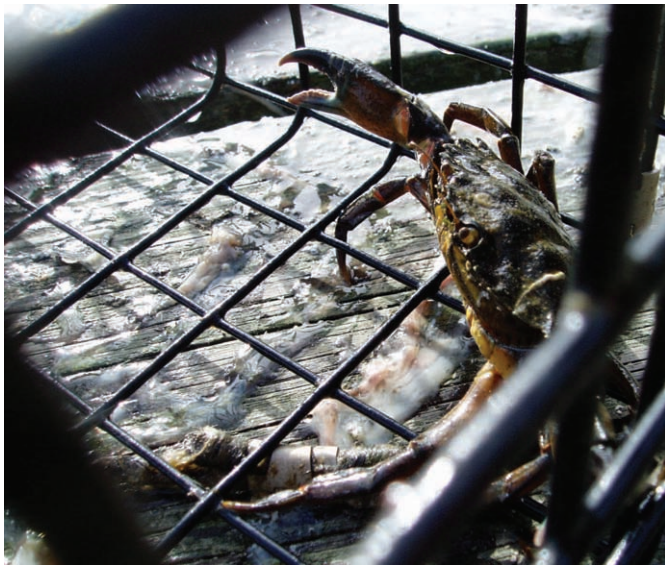
Figure 18. The invasive green crab Carcinus maenas sometimes finds its way into scallop cages.

the juveniles in the late fall when the temperatures start dropping also helps minimize losses as it coincides with a decrease in predator activity. Scallops may also be fenced in to lessen attacks from mobile predators.