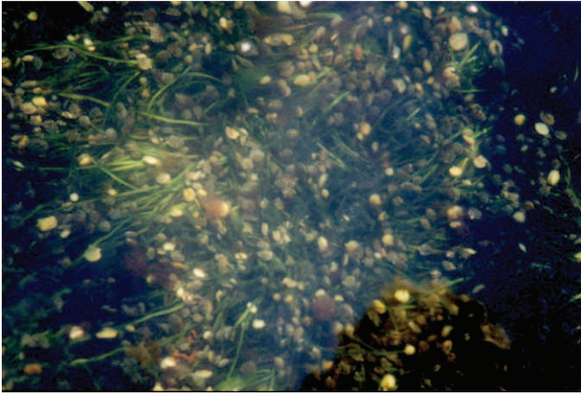
Figure 5. Scallop growing in eelgrass on the bottom.

The success of this method of growout is dependent on the overall size of the released juveniles and the suite of predators found in the release area. The objective is to nursery rear the juvenile scallops beyond the size threshold for direct predation. It is generally thought that juvenile scallops greater than 35 mm are large enough to minimize predation risk. Holding juveniles until 40-50 mm provides even more protection.