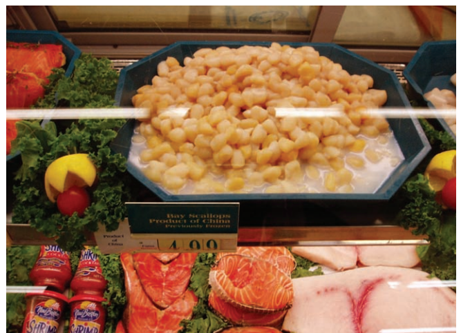
Figure 2. The Chinese cultured bay scallop is available in U.S. markets.

The limited success of scallop aquaculture in the US has been attributed to high labor costs and winter mortalities associated with the "grow-out" phase of the culture cycle. Once the bay scallop has achieved a juvenile