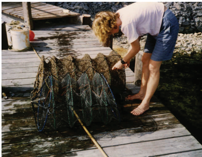
Figure 12. Transferring scallops into a clean lantern net.

The method of choice is the use of redundant holding gear where the scallops are transferred from fouled gear to clean gear (Figure 12).