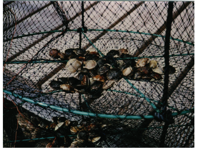
Figure 6. Clean lantern net with seed ready for deployment.

An important consideration when suspending scallop culture gear is the depth of deployment. The nets