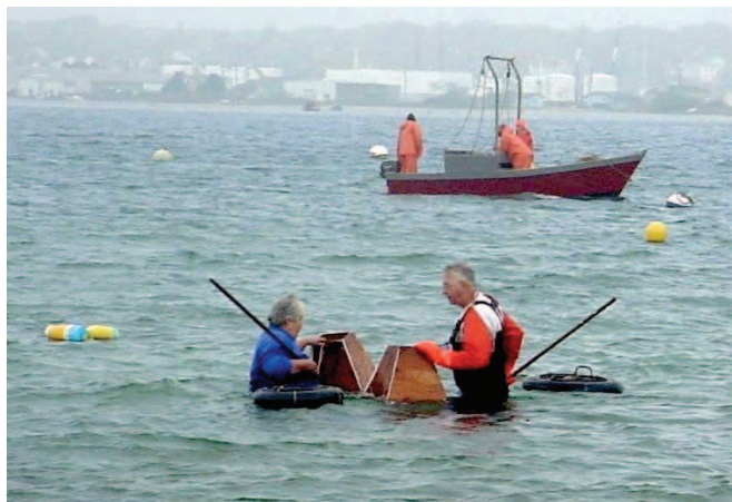
Figure 14. Hand harvesting with a view box in the foreground, mechanical harvesting with boat and dredge in the background.

Hand harvesting in shallow waters requires the use of a glass-bottomed view box and a dip net while in deeper waters, skin-diving or scuba gear is usually used (Figure 14).