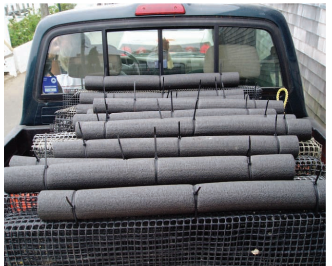
Figure 9. ADPI bags equipped with floating noodles.

More recently, another oyster growout method has been adapted for scallop culture. This consists of a plastic mesh bag with two flotation “logs” arranged along the sides of the bag. The flotation logs range from children’s foam swim “noodles” to rigid plastic cylinders designed for this application (Figure 9).