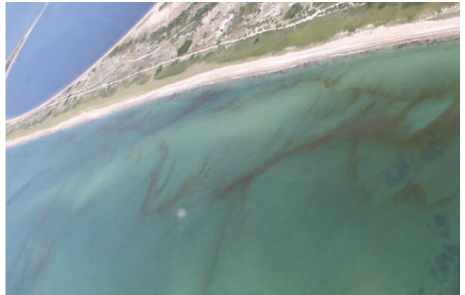
Figure 19. A bloom of Cochlodinium polykrikoides on the island of Nantucket, MA.

Every U.S. coastal state with a commercial shellfish industry is required to monitor harmful algal blooms of consequence to human health under the National Shellfish Sanitation Program Model Ordinance (NSSP