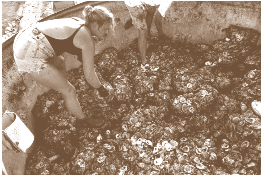
Large fiberglass cylindrical tank for holding cultch containers — in this example, containers are bags of shell.

Many sizes and types of remote setting tanks have been used successfully. Large tanks will minimize the number of settings