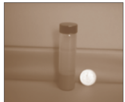
A capsule of one million eyed larvae.

Introduction Selection of setting and nursery sites Cultch selection and preparation Cultch containers Setting equipment Water delivery Preparing the setting tank Adding larvae to the tank Feeding oyster larvae Record keeping Cleaning the tank Nursery area Planting in production beds Summary