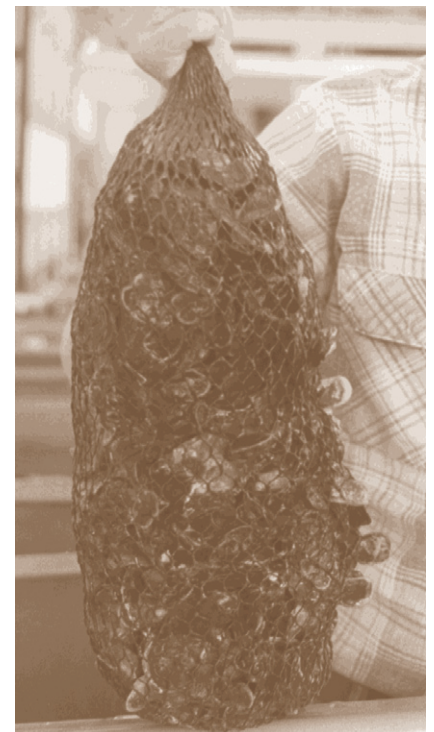
Oyster netting is a common shellbag material.

Important considerations in choosing cultch containers are that they be nontoxic and sturdy and that they allow for good water flow to oyster larvae. The kind of container and its size may influence the type of setting tank you use; most importantly, it will determine your labor and equipment needs in filling, transporting and planting, factors that all affect profitability. A container with cultch weighing 30 pounds will weigh approximately 40 pounds when retrieved from the nursery area; this increased weight is the result of oyster seed, sediments, and fouling. The added weight must be considered in whether you use machinery or hand labor. Handling small containers may