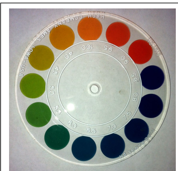
Simple water test kits may be purchased to determine the pH, alkalinity, hardness and ammonia concentration of your pond.

The pH of the water garden should also be considered and is measured on a scale from 0-14. A pH 7 is neutral, less than 7 is acidic, and greater than 7 is basic. The pH fluctuates daily due to the activities of photosynthesis and respiration and should normally cycle from 6.5 to 9 without harming the fish; if the pH is outside of this range, buffers should be added to increase the alkalinity.