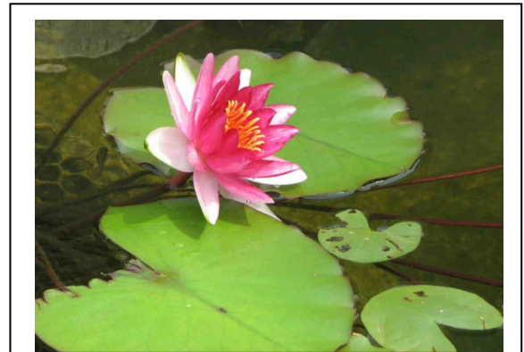
This lily has been planted in a pot to prevent unwanted expansion and protected with a wire mesh as seen below to protect it from grazing by fish.

Enclosures may be used to protect the plants from being eaten by plant-eating fish like koi. A simple cage-like structure constructed with PVC coated wire, plastic mesh, or net can be constructed for submerged and emergent plants. Use PVC with plastic mesh to float a cage around the plant for floating plants. Using browse resistant plants such as reeds and lilies, or feeding fish small amounts several times throughout the day can also help reduce destruction of plants. The enclosures also serve as sanctuaries for smaller fish and protection for spawned eggs.