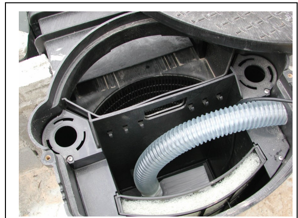
This mechanical filter collects leaves and larger debris in the reservoir while the fiber and foam filters help trap particles of dirt and organic matter.

Biological filters help to remove excess nitrogen that is produced from fish wastes and the decomposition of organic matter in the ornamental pond. Natural filtration, using plants, is most often achieved by using submerged aquatic plants. Building a plant basin equal to 10 percent of the ornamental pond's surface area through which the pond water is circulated every 2-4 hours can also be used as a means of natural filtration, and acts as a settling chamber for solid wastes after plants have removed excess nutrients. Nutrients can be also be removed by algae and bacteria. Bacteria bio-filtration, which is common in pools where fish are the main attraction, can only occur if the bacteria are provided with the proper substrate and environment. This filtration process using nitrifying bacteria mimics the natural process, hastening it by seeding the bio-filter with a prepared commercial mix and layers of gravel or sand on which the bacteria may grow. These types of systems operate best at a pH of 7 to 8 and an alkalinity greater than or equal to 50 ppm, but they consume alkalinity