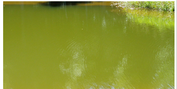
Excessive nutrient input may stimulate algal growth and should be controlled. Algal blooms can be controlled by avoiding over-stocking and over-feeding fish or over-fertilizing plants.

Ammonia and nitrite are also common causes of problems in ornamental ponds. Ammonia is the major nitrogen waste excreted by fish, and certain types of bacteria decompose or nitrify ammonia into nitrite. Both ammonia and nitrite are toxic to fish, but are usually removed by plants and used as nutrients for growth before they become problems in ornamental pools. They can both become hazardous if fish are over-fed, if plants are over-fertilized, or because of rapid decomposition of organic matter. Like other nutrients, these should be removed by adding plants, using bio-filtration, flushing, or adding bacterial water conditioners to speed the nitrification process.