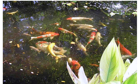
The most common types of fish used in ornamental fish ponds are koi (above) and goldfish. Koi and goldfish are often selected due to their various colors and body forms, but they are also tolerant of a wide range of water quality.

The most common types of fish used in ornamental fish ponds—goldfish and koi—belong to the carp family. Koi have been selectively bred for centuries from the common carp, Cyprinus carpio , to obtain their unique color, scale, and fin characteristics. Few people realize they are the same species as the common carp, just as a thoroughbred horse is the same species as a wild mustang. Development of the goldfish was accomplished by a millennium of selective breeding of the Prussian carp, Carassius gibelio or Carassius auratus gibelio . The coloration of the goldfish was obtained by breeding Prussian carp that had a recessive genetic mutation yielding a yellowish-orange coloration rather than the normal olive-grey appearance. After a millenium of breeding, the goldfish is now considered by many as a unique species, Carassius auratus , with unique scale counts and body morphology. However, it is not uncommon for feral goldfish to revert back to the olive-grey coloration after several generations of breeding in the wild.