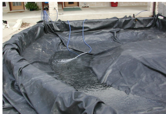
A pond properly constructed with tiered sides and ledges for plants. Fill the pond gradually, as above, to equalize the pressure between the liner and the ground. The above ground berm prevents contamination from stormwater runoff.

Ornamental ponds that are constructed 2/3 below ground are kept warm during cold weather and cool during hot weather, but such excavated pools may have problems with run-off. Run-off water may have contaminants and cause muddiness and oxygen problems in your ornamental pond. Additionally, rainwater saturation of the soil underneath the pool can float the ornamental pond structure, so it is important to use under-pool drainage or a water-pressure relief system and to know the soil type present in your area. Consult with the United States Department of