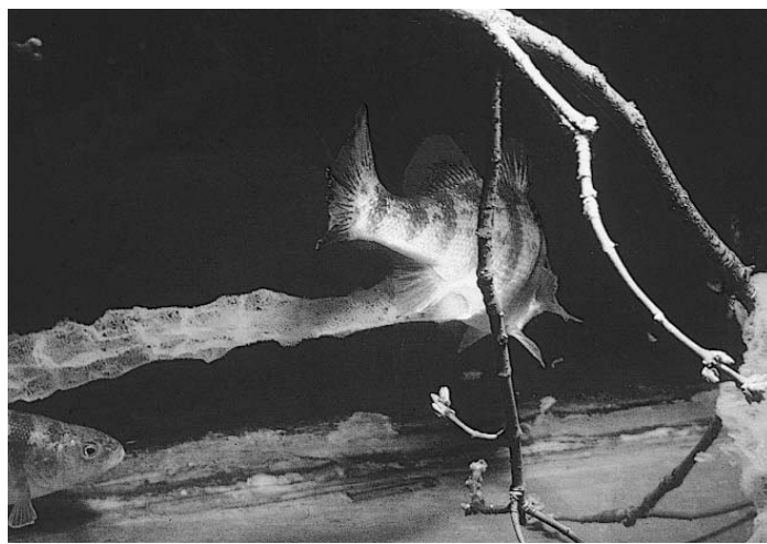
Spawning female yellow perch (Perca flavescens) and trailing egg ribbon.

The following traits are also extremely important and worthy of inclusion in a table of ideal culture fish characteristics.