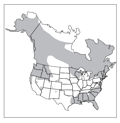
Fig. 2. Distribution of the river otter in North America.

the belly, where it is usually lighter, varying from brown to almost beige.