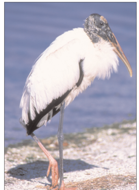
Figure 5. Wood Stork.