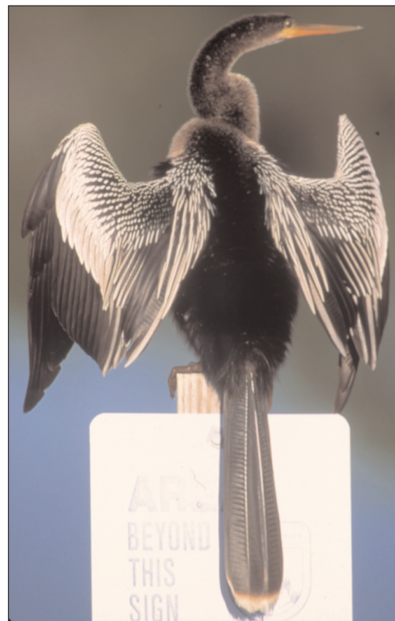
Figure 3. Anhinga.

Similar species: Double-crested Cormorant, Anhinga