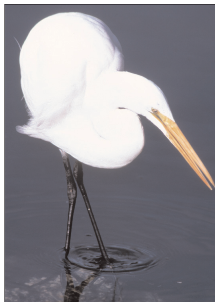
Figure 8. Great Egret.