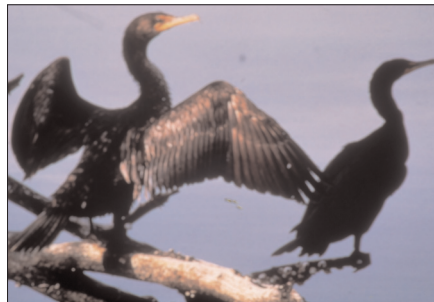
Figure 1. Double-crested Cormorant.

This publication describes common avian predators that affect aquaculture and discusses options for managing them. There are brief summaries on other species that frequent aquaculture facilities but rarely cause serious losses (or for which the economic impact has not been established). Following each species description is a list of related or look-alike species.