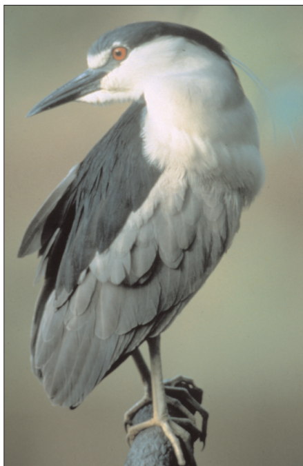
Figure 7. Black-crowned Night Heron.

Similar species: Little Blue Heron, Sandhill Crane