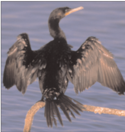
Figure 2. Neotropic Cormorant.

Similar species: Neotropic Cormorant, Anhinga