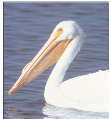
Figure 4. American White Pelican.

Similar species: Double-crested Cormorant, Neotropic Cormorant