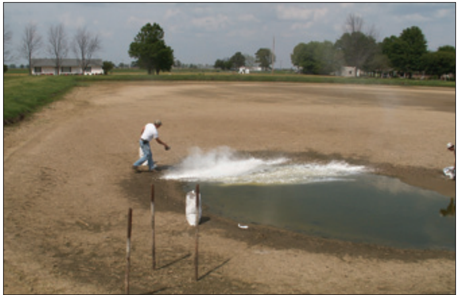
Figure 4. Earthen ponds can be disinfected by drying and treating with hydrated lime.

In summary, prevent diseases by scrubbing equipment with warm, soapy water and then drying the equipment thoroughly before reuse. Clean, rinse and dry trucks, seines and other equipment used for fish from another facility or fish from the wild. Applying a broad-spectrum disinfectant to cleaned equipment gives further protection to your fish stocks.