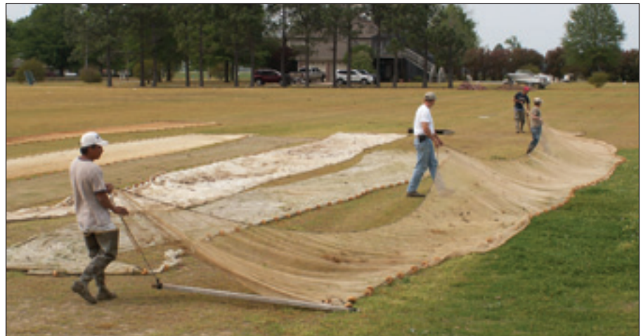
Figure 1. Drying equipment, such as seine nets, before using them kills many pathogens.

long enough to kill disease organisms. Rinsing after disinfection ensures that no residues are left behind. Drying equipment in the sun will destroy bacteria or viruses that may have survived. The choice of chemical cleaner or disinfectant is critical. Consider the type of disease organism you are trying to control and the type of equipment you are disinfecting, as well as the cost and safety of the chemical. Methods of cleaning and disinfecting are shown in Table 1.