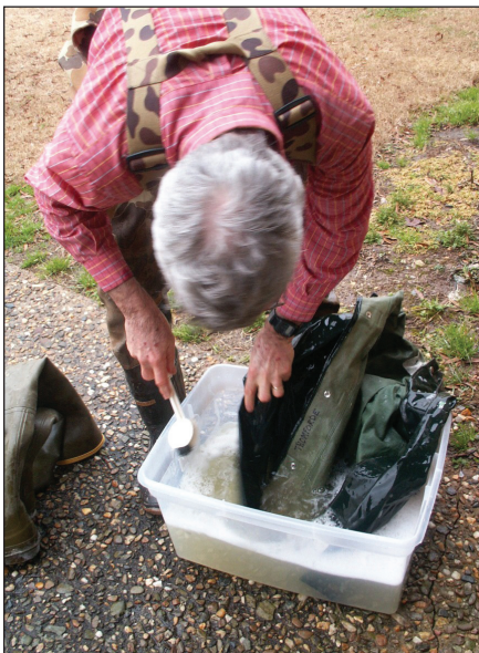
Figure 2. Warm water and detergent can be used to clean equipment.