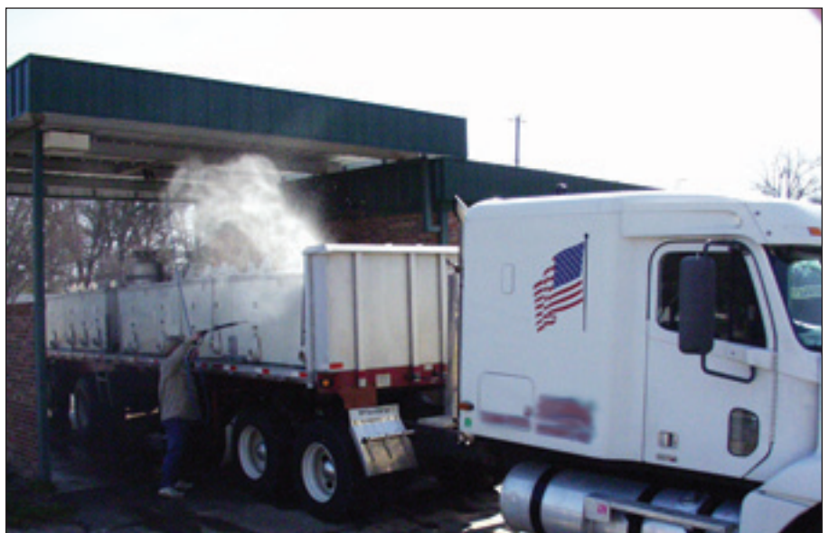
Figure 3. Transport trucks and other vehicles can be cleaned easily with a high-pressure hose at the local carwash.