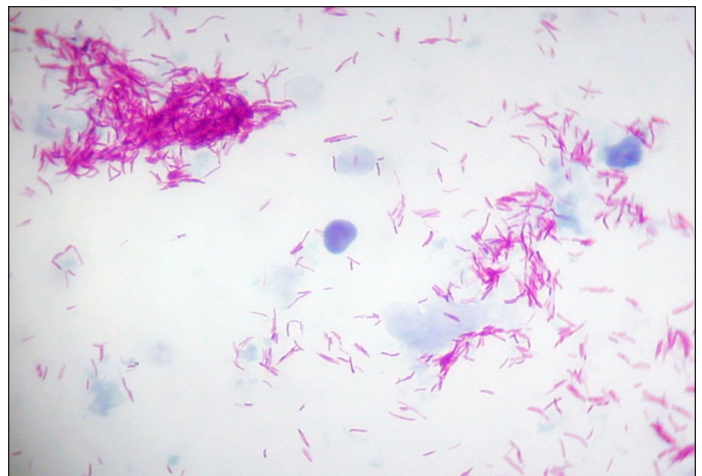
Figure 5. Pink-staining acid-fast rods visible in a bench-top stain of fresh tissue from a fish infected with mycobacteriosis (1000x).

Observing acid-fast staining rods during histological examination would be strong support for a diagnosis of mycobacteriosis (Fig. 4). Organisms are most likely to be present either intracellularly or extracellularly within granulomas, although if there are few live bacteria in tissue the acid-fast rods may not be seen. The ability to see acid-fast rods in tissue can also be affected by processing. The decalcification process, in particular, may prevent organisms from taking up the acid-fast stain. Immunocytochemistry can be used to support a diagnosis of mycobacterium and may be more sensitive than the visualization of organisms using special stains. However, it will not identify the organism to species.