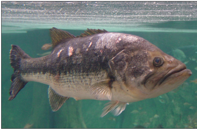
Figure 3. Largemouth bass showing clinical signs consistent with mycobacteriosis. The fish is thin and has obvious scale loss and shallow ulcers visible on the skin.

Reproductive problems are often part of the history of a mycobacterial case. Increased mortality and reproductive problems have been reported in affected zebrafish colonies. Because of the low level and chronic nature of mortality, poor reproductive performance may be the primary complaint that leads to diagnostic investigation of these fish. Although granulomas are a classic lesion associated with mycobacteriosis, they do not always develop. Further, Mycobacteria spp. have been isolated from tissue of clinically normal fish in the absence of obvious disease or pathology.