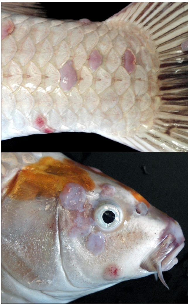
Typical carp pox growths on the skin of a koi.

The skin disease caused by the carp pox virus is quite easy to recognize. Diseased fish have soft, pink, translucent, wart-like growths on their skin. The growths are so fragile that they can usually be removed by gently rubbing a finger over the growth. This is not a good treatment for carp pox because the growth is likely to come back and because the rubbing damages the skin and makes it susceptible to secondary bacterial infection. However, verifying that the growths are soft and fragile does help to distinguish carp pox from some similar looking tumors and parasite infections. The best way to manage carp pox disease is to just wait for spring, or to slowly warm the fish to temperatures in the mid 70s to the mid 80s (°F). It is very rare for fish to die from carp pox, but large growths do sometimes leave scars on valuable show fish. Therefore, it may be important to warm show fish that have carp pox disease when the growths are still in their early stages.