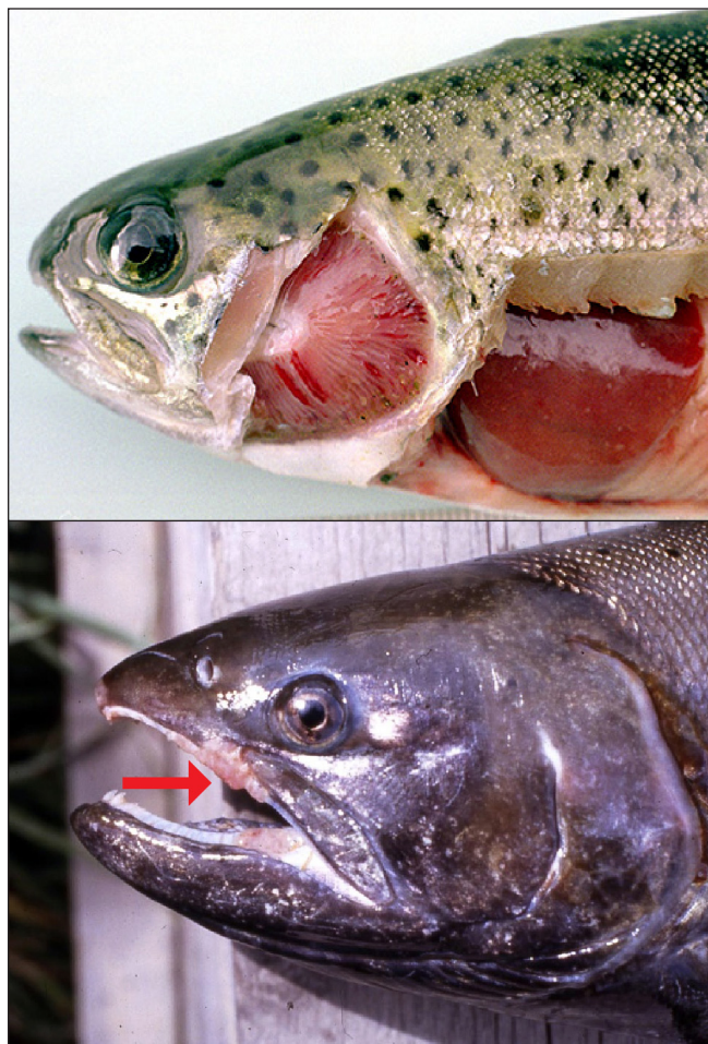
On the top is a rainbow trout with OMV disease. The pale gills and white spots on the liver are typical symptoms. On the bottom is a wild Masu salmon with a jaw tumor (arrow) caused by OMV.

There are two well-known herpesviruses of salmonids. They are Salmonid herpesvirus-1 (SalHV-1) and Salmonid herpesvirus-2 (SalHV-2; common name Oncorhynchus masou virus or OMV). The SalHV-1 was initially isolated from rainbow trout in the state of Washington, but it is not an important cause of disease. OMV, however, does cause an important disease in Pacific salmon and in rainbow trout. The disease is usually characterized by skin ulcers and red or white spots in internal organs. Survivors often