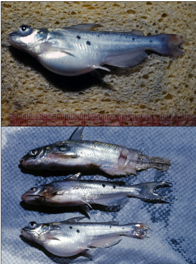
These very famous pictures of CCV disease are from the collection of Dr. John Plumb. The fish on the top has a swollen abdomen and pop-eye typical of CCV. The fish on the bottom have CCV, but also a co-infection by columnaris bacteria. The swollen abdomen is from CCV, while the eroded fins and tails are caused by columnaris disease.

catfish. Given that channel catfish are commonly reared in state hatchery and stocking programs, it is also very likely that CCV is widespread in wild catfish populations. As with carp pox and the GHV, catfish producers assume that the virus is present and manage their facilities to reduce the probability that the disease will develop.