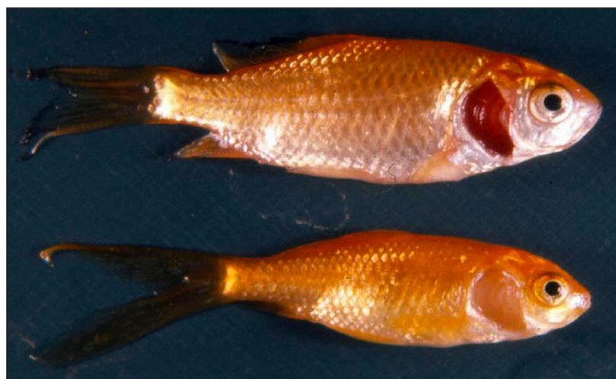
A goldfish with normal red gills (above) and a goldfish with anemia and the pale gills typical of GHV disease (below).

The disease can be prevented if the combinations of stress and temperatures in the 70s (°F) can be avoided. It can be treated by elevating temperatures into the low to mid 80s (°F). At these higher temperatures, the fish's immune system is able to successfully defeat the disease. Of course, surviving fish are GHV carriers.