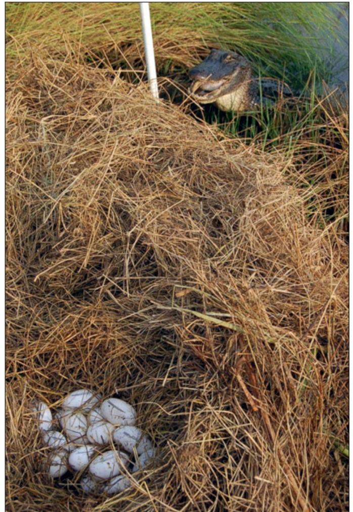
Female alligators will aggressively defend their nests.

Alligator farming in the southeastern U.S. has become a valuable industry over the past 30 years. State, federal, and international regulations ensure the sustainable use of this renewable resource and also the conservation of the species and its wetland habitat. The technology has been developed to humanely raise large numbers of alligators in climate-controlled facilities to meet the global market demand.