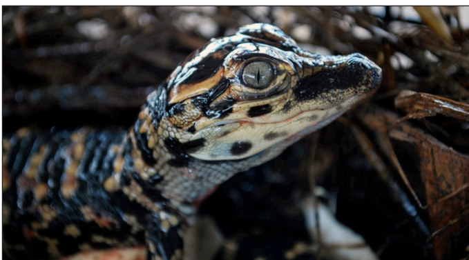
Hatchling American alligator.

Alligators in the wild reach sexual maturity in about 8 to 10 years when they are at least 6 feet long. Nesting occurs during early summer and the average clutch size is