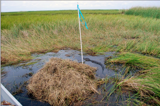
Alligator nest in Louisiana coastal marsh.

The American alligator is a wetland species native to the southeastern U.S. from Florida to Texas and as far north as Arkansas and North Carolina. The largest natural populations are found in the coastal marshes of Louisiana and the swamps and Everglades of Florida.