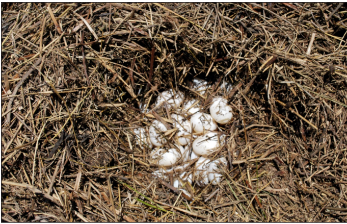
Alligator eggs buried in the nest cavity.

ties. State regulations control the number of eggs that can be collected to maintain healthy wild populations. However, whatever the source of eggs, all production facilities are referred to as alligator farms.