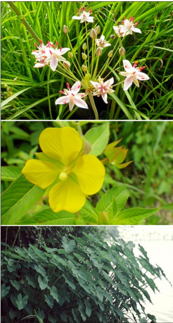
Figure 7. Invasive shoreline emergent plants. Upper: flowering rush. Center: primrosewillow. Lower: wild taro.

gent shoreline invaders include flowering rush ( Butomus umbellatus ), primrose-willow ( Ludwigia peruviana ), and wild taro ( Colocasia esculenta ) (Fig. 7).