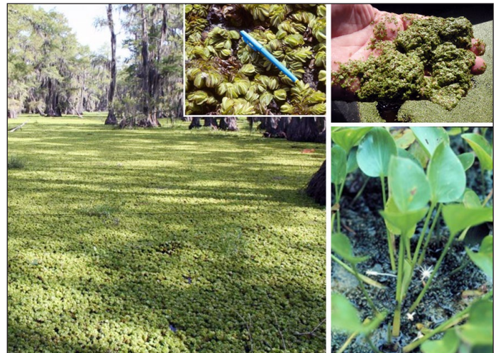
Figure 4. Floating plants. Left: giant salvinia (invasive). Upper right: duckweed (native). Lower right: frog's-bit (native).

intentionally to aquatic systems. The accidental introduction of invasive plants happens quite often. In addition to escaping cultivation, weeds can “hitchhike” as contaminants when desirable native plants are transported and sold. Misidentification is rampant, particularly among hobbyists. Before planting native aquatic species, it is critically important to inspect plant material to verify the identity of the plants being received and to avoid planting exotic hitchhikers.