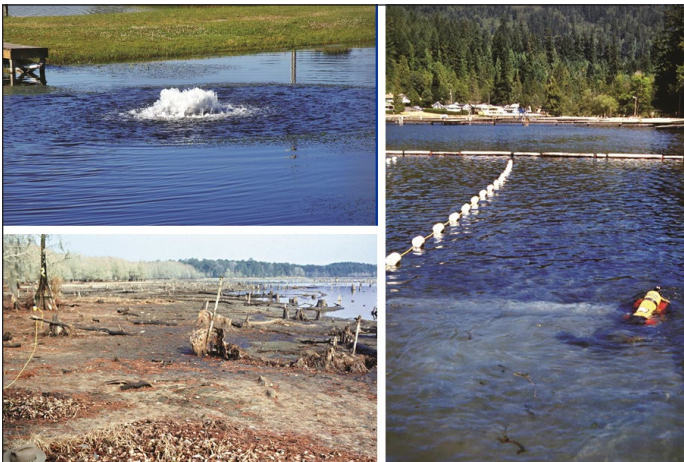
Figure 12. Cultural control methods. Upper left: aerator. Lower left: drawdown. Right: benthic barrier being deployed.

Cultural and physical control methods (Fig. 12) can sometimes be used if they are appropriate for your situation. For example, some populations of algae can be reduced by aerating the pond (introducing oxygen to the bottom of the water column), adding alum to inactivate phosphorus in the water column, or using dyes or pond covers to reduce light penetration. However, these methods are most effective before serious algae blooms occur and have limited use once algae has taken over a pond. Submersed weeds can be managed by installing benthic barriers, which smother the weeds; these can be made from durable materials such as vinyl or plastic or from biodegradable materials such as burlap. Submersed weeds also can be controlled by lowering the water level (drawdown) and allowing the bottom sediments to dry out for several months. Although useful, benthic bar-