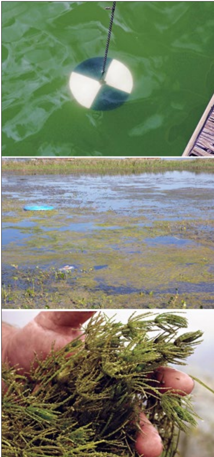
Figure 5. Algae. Upper: planktonic algae. Center: filamentous algae. Lower: Macrophytic algae.

Algae are the base of the food chain and the primary food source for small aquatic organisms. It is estimated that algae also provide as much as half of the planet's oxygen through the process of photosynthesis, or the conversion of sunlight and carbon dioxide to energy and oxygen. There are many forms and species of algae, ranging from