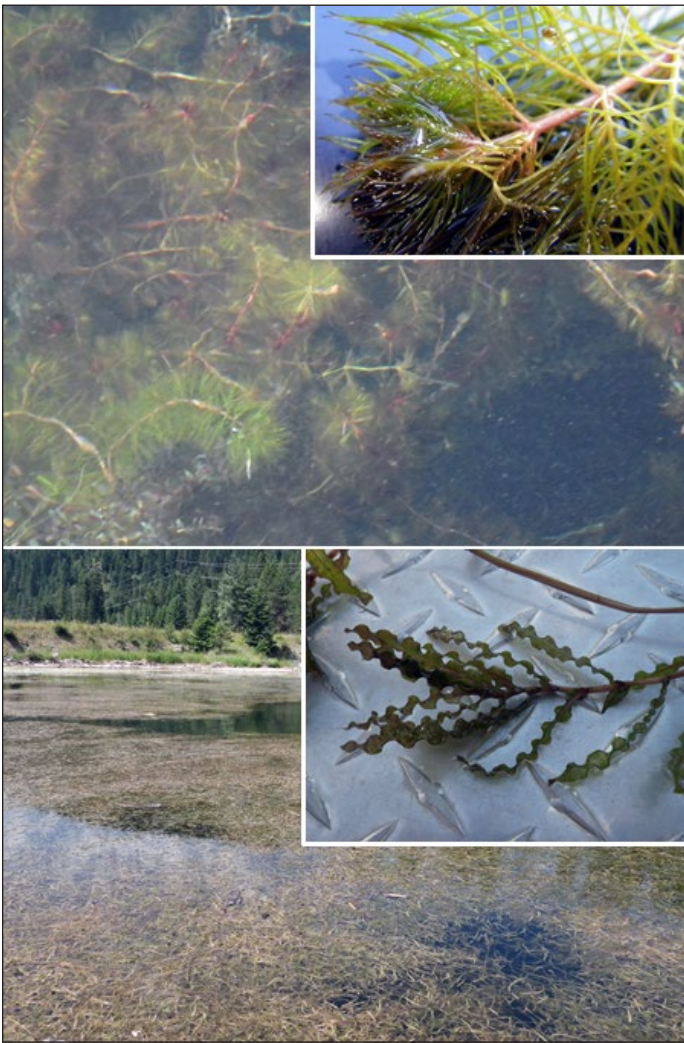
Figure 9. Invasive submersed plants. Upper: Eurasian watermilfoil. Lower: curlyleaf pondweed.

tion digital photographs of the plant to your aquaculture or fisheries specialist or other trained individual (do not send live or pressed specimens unless the identifier requests them). Be sure to provide good, clear, in-focus images that will be useful for identification. Your photo collection should include a shot of the habitat where the plant occurs (from a distance to show scale and close up to show detail) and a portrait of the entire plant, both submersed and emergent plant parts. More detailed images are useful as well. Use a solid background (white, black, or gray) as a backdrop for detailed images. Place a ruler, pencil, or other object of known size in the frame to show size or scale. Detailed images should include: