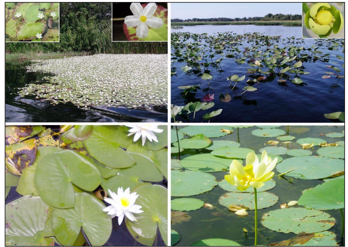
Figure 3. Floating-leaved emergent plants. Upper left: crested floating-heart (invasive). Lower left: fragrant white waterlily (native). Upper right: spatterdock (native). Lower right: American lotus (native).

Water hyacinth and hydrilla quickly become invasive almost everywhere they are introduced, but they are not the only aquatic plants that cause problems in natural systems, reservoirs, aquaculture ponds, and canals in the southeastern U.S. Crested floatingheart ( Nymphoides cristata ) (Fig. 3), which was introduced as an ornamental water garden plant, is invading lakes and reservoirs in the region. Populations of giant salvinia ( Salvinia molesta ) (Fig. 4), which was also introduced through the aquarium and water garden industries, now forms dense floating mats with consequences similar to those described for water hyacinth. Crested floatingheart and giant salvinia likely escaped cultivation rather than being introduced