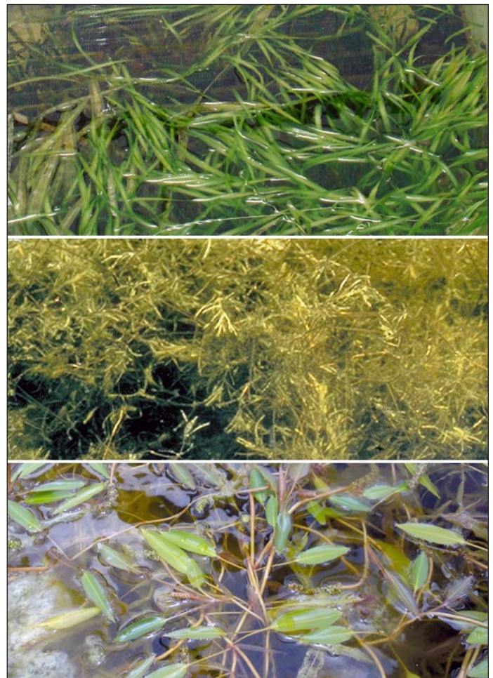
Figure 8. Native submersed plants. Upper: eelgrass. Center: southern naiad. Lower: Illinois pondweed.

In order to select the most effective weed control method, the invader must first be positively identified. The most common way to do this is to send high-resolu-