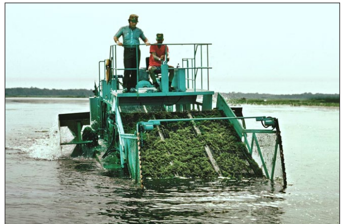
Figure 13. Mechanical harvester gathering hydrilla.

Manual removal or mechanical control can be an option, particularly if the invasion is small and localized. Target weeds can be pulled by hand or with a rake if the water is shallow enough. The success of this method will depend on whether it is possible to remove entire plants. Many aquatic invaders will regrow from root crowns, tubers, rhizomes, or plant fragments, so all plant material must be completely removed for this method to be successful.