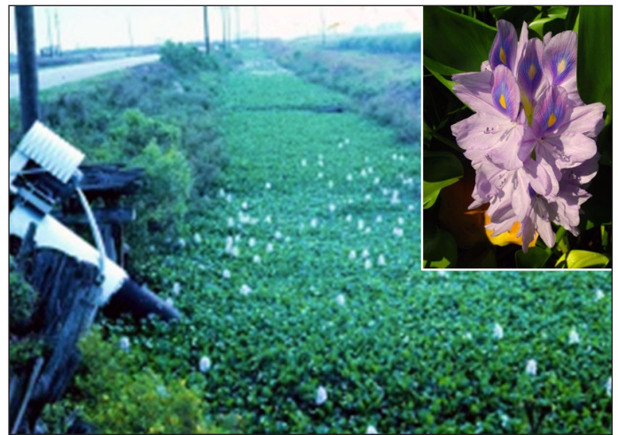
Figure 1. Water hyacinth was introduced to the U.S. in the 1880s and is one of the world's worst weeds.

Many aquatic weed problems in the U.S. are the result of intentional introduction. For example, the floating weed water hyacinth was reportedly introduced in the U.S. at the Southern States Cotton Expo in New Orleans in the 1880s, where visitors were given water hyacinth plants as souvenirs. Local legend states that a Florida resident brought plants back to his water garden near the