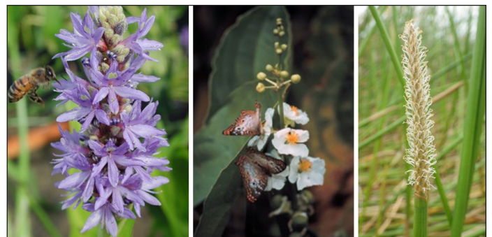
Figure 6. Native shoreline emergent plants. Left: pickerelweed. Center: duck potato. Right: Gulf Coast spikerush.

Emergent plants are rooted in the sediment, but some or most of the plant's growth is above the waterline. Shoreline or littoral zone emergent plants are usually found in the transitional zone between deeper water (more than 3 feet [1 m] deep) and the moist shoreline. Emergent shoreline plants help to stabilize the shoreline and prevent erosion while providing food, cover, and nesting grounds for animals that live near water. Native emergent shoreline species include pickerelweed ( Pontederia cordata ), duck potato ( Sagittaria latifolia ), and rushes ( Eleocharis , Scirpus , and Schoenoplectus sp.) (Fig. 6). Emer-