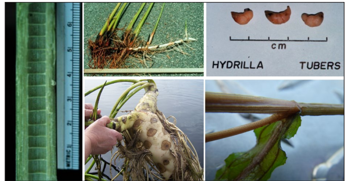
Figure 10. Vegetative plant parts. Clockwise from left: cut stem showing interior structure; runners and roots; tubers; leaf attachment and arrangement; rhizome.

region where the leaf attaches to the stem—common in grasses) if present.