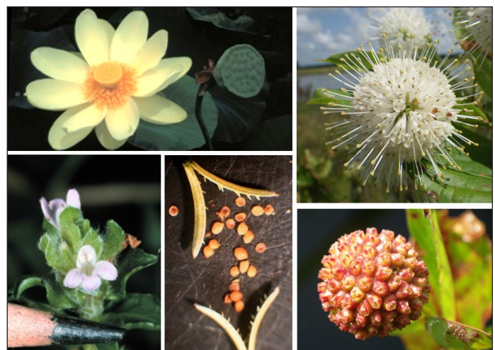
Figure 11. Reproductive structures. Clockwise from upper left: flower and unripe seed pod; inflorescence; ripe seeds; capsule with seeds; flower size and position.

If possible, collect and press a specimen for reference. If the species has not been found in your area before, your local herbarium may ask you to submit a dried sample so they can voucher the plant and have a record of its presence.