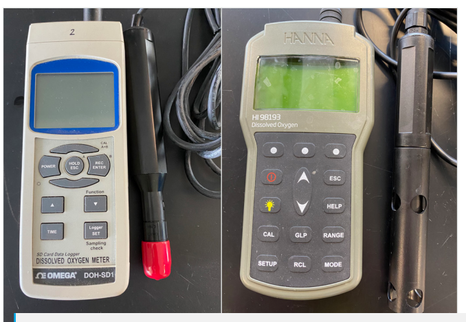
Figure 1. Two examples of meters available on the market for accurate measurements of dissolved oxygen in the water.

Diffused aeration using air stones or porous hose is mandatory in an aquaponic system, especially in the summer months with high water temperatures. Growers have successfully grown lettuce in an aquaponic system without added aeration in the winter months because cold water holds more DO. Air stones should be placed 3 to 4 feet apart in the plant trough, and additional air stones should be placed in the fish tanks and biological filtration tanks. Fish exhibit certain behaviors indicative of low oxygen levels in the water. When fish are oxygen deprived, they exhibit the following traits: appetite loss, "piping" or surface gasping, gathering around inflow pipes that contain more oxygenated water, reduced growth, and increased susceptibility to diseases and parasites.