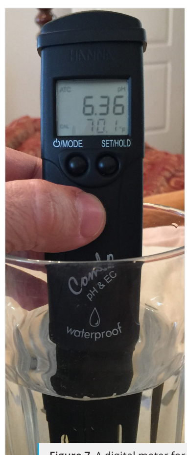
Figure 7. A digital meter for measuring pH, electrical conductivity (EC), and the temperature of water.

For scientific research, commercial production, or for more accurate measurements, many companies provide digital meters for measuring pH, electrical conductivity, DO, and temperature. A pH meter can cost anywhere from about $30 to a few hundred dollars (Fig. 7), and DO meters can cost a few thousand dollars. Spectrophotometers (Fig. 8) are also available for accurate measurements of individual parameters. Additionally, certified labs are available that measure water quality parameters.