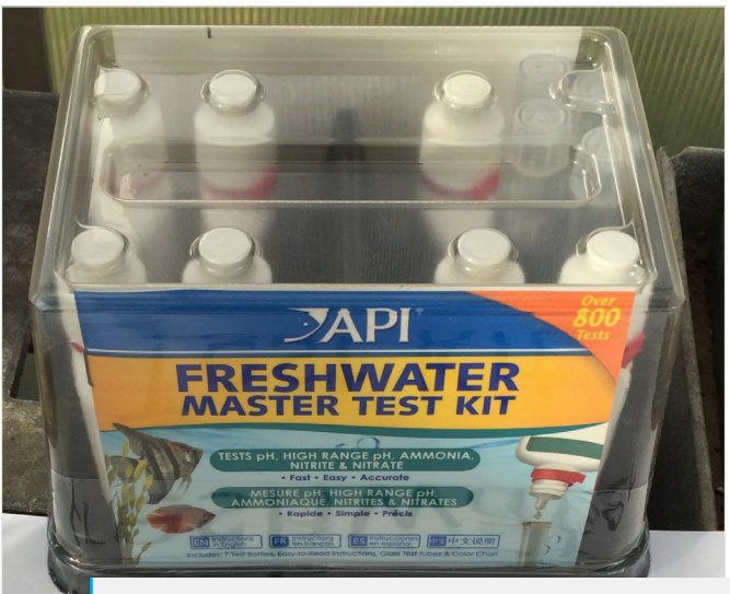
Figure 6. The Freshwater Master Test Kit includes tests for high and low pH, ammonia, nitrite, and nitrate.

The system is ready when ammonia and nitrite rates are at nearly 0 ppm, and nitrate is at least 10 ppm. Additional clear ammonia may be needed to be added to maintain 20 ppm ammonia levels until 10 ppm of nitrate is detected. Do not wait too long to add fish and to start feeding once the ammonia and nitrite rates are at nearly 0 ppm and nitrate is at 10 ppm, or the bacteria populations will starve and collapse.