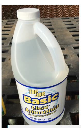
Figure 5. Clear ammonia is used as a source of ammonia for the bacteria in the starter solution to speed up the proliferation and establishment of bacteria in a new system.