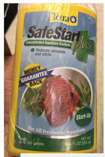
Figure 4. Example of a starter solution containing Nitrosomonas and Nitrobacter bacteria that can be used to speed up the initial startup of a new system.

Nitrosomonas spp. and Nitrobacter spp. (Fig. 4). Several commercial starter cultures of bacteria are available from various manufacturers. A food source for the bacteria must be added to the system. The ideal food choice is clear ammonia (Fig. 5) at a concentration of 20 ppm, but this concentration is toxic to fish, so the ammonia must be effectively converted to nitrate before adding fish to the system. Once the system is filled with water and aerated for a couple of days to release carbon dioxide (CO<sub>2</sub>) and any chlorine (Cl) gas, add the bacteria starter solution and clear ammonia. In a 1,000-gallon system, add 2.5 fluid ounces of clear ammonia. Then, measure ammonia, nitrite, and nitrate daily using a commercially available test kit (Fig. 6).