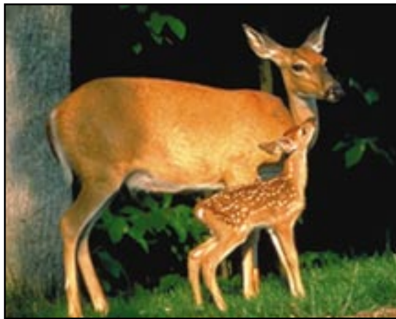
Hiding cover is especially important during fawning season.

The diet of white-tailed deer in Texas is varied and changes with the seasons (Figure 1). They prefer forbs and mast, which are highly seasonal and can vary greatly from one year to