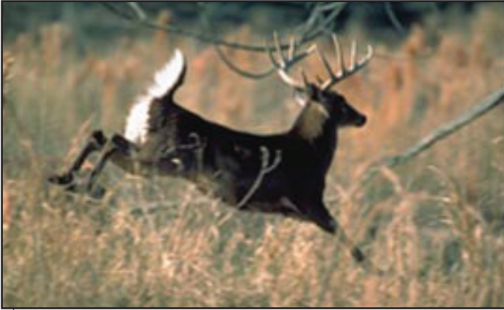
Home range size for white-tailed deer can be from 60 to 800 acres or more.