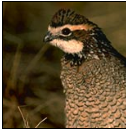
For quail, the habitat must supply many seeds and insects.

Herbicides can be used with caution. Do not use non-selective, broadcast herbicide treatments: They can decrease loafing cover when few brush species are present. However, herbicides applied as individual plant treatments offer great selectivity and flexibility for brush management.