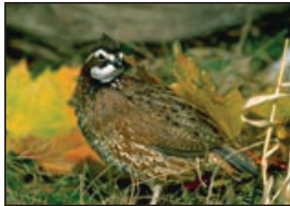
Quail need vegetation less than 6 inches tall for roosting. Turkeys prefer to nest in rangeland in high conditions.