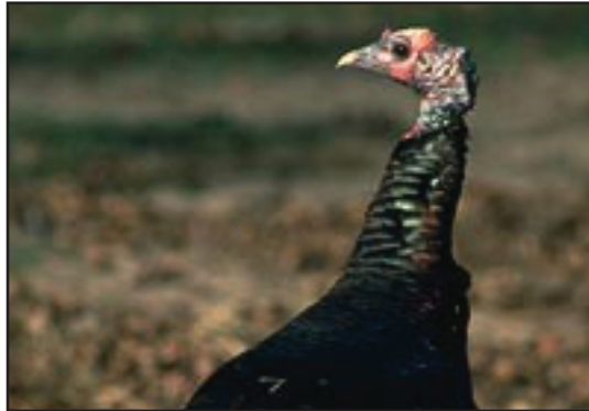
Distribution of turkeys in Texas is correlated to precipitation.

Turkeys do best with more mature stands of brush, whereas quail prefer brush less than 5 years old. Turkeys prefer to nest in rangeland in high condition. Turkey hens need clumps of residual grass about 2 feet in diameter and 1.5 feet tall; quail need 8x12-inch clumps. Nesting turkeys appear to seek ungrazed pastures or those in a grazing system.