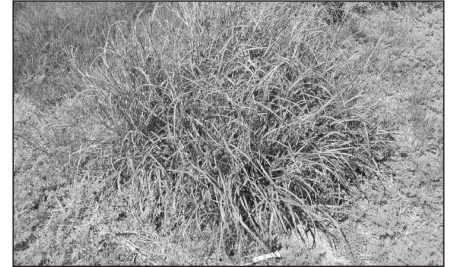
Figure 2. Two examples of grasses that produce clumps and could be used as nesting sites by quail.