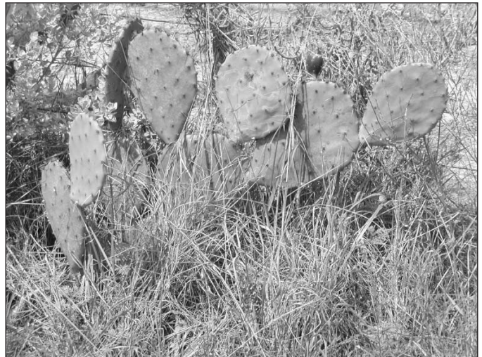
Figure 3. An example of a prickly pear clump that could be used for nesting cover by quail.