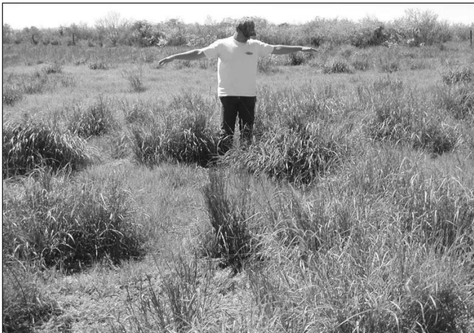
Figure 1. Counting clump grasses along a transect.